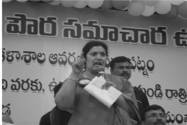
Dr. Daggubati Purandeswari, Union Minister of State for Human Resource Development (Higher Education), Govt. of India, addressing the public during the inaugural session of PIC at Bhimunipatnam, Visakhapatnam district of A.P. on 19th November 2011